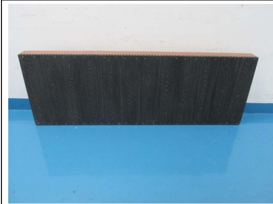
Sample as received